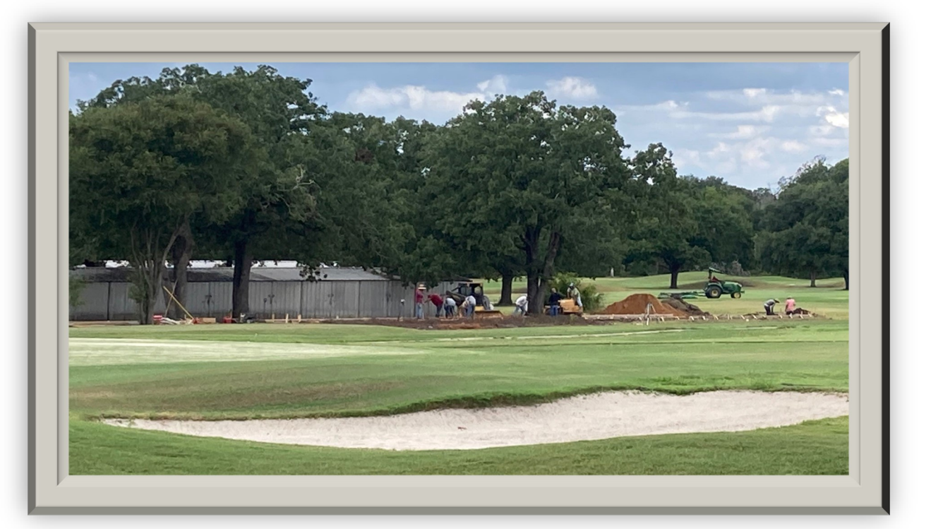
Starting Construction of 16 New Cart Barns